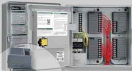
Easy-to-install modules allow you to customize the ICC from 8 to 48 stations.

It's an idea that makes so much sense... while saving you so many dollars. For the professionals who stock and carry controllers, modules make inventory control easy—there's no need to estimate how many of each size controller you need to keep on hand. Now you simply stock modules. And that means, for customers whose systems require a non-standard number of stations, with modules you can customize the controller to the exact needs of the project—even if those needs change as the project grows.